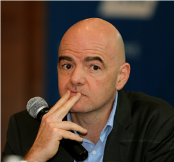
Gianni Infantino, president of FIFA, at a press conference.