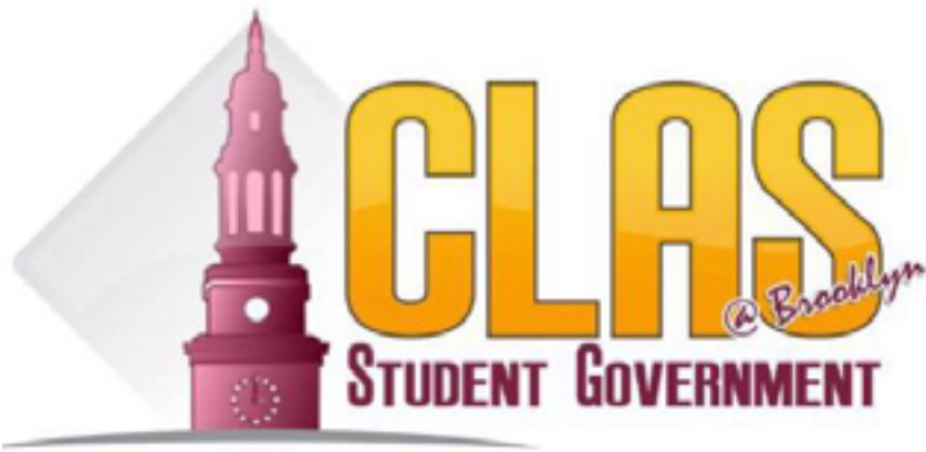
The CLAS Student Government logo.

Expect updates on this story, SGS’s role, and the overall transition in the coming weeks.